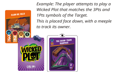
Example: The player attempts to play a Wicked Plot that matches the 3Pts and 1Pts symbols of the Target. This is placed face down, with a meeple to track its owner.

If you have no cards on hand that match any available Targets, discard one and draw another, until you can use the drawn card.