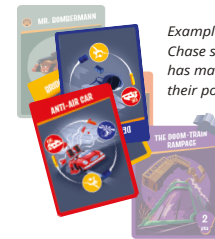
Example: After a short, but intense Chase sequence, the Evil Player has managed to sneak off with their points.

Alternate rule: Pocket the evidence. If the Handler wins the Chase, they may pocket the points. And the bad conscience.