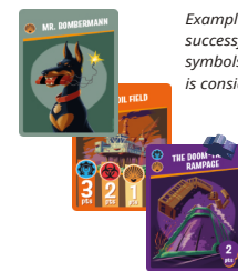
Example: The DIC Handler has successfully matched one of the symbols of the Wicked Plot, and the Plot is considered foiled (for now).

If the DIC Handler have no cards on hand that match any available Targets, they may discard one and draw another, until they can use the drawn card.